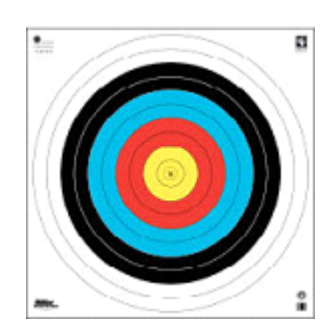
60 cm used in unsighted & sighted divisions